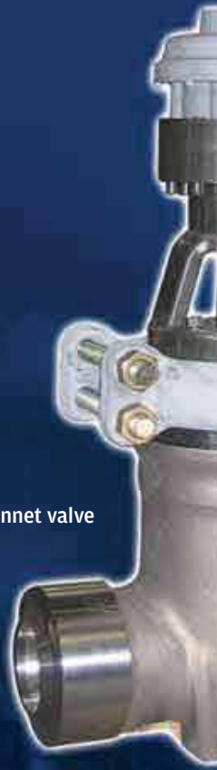
Pressure seal bonnet valve