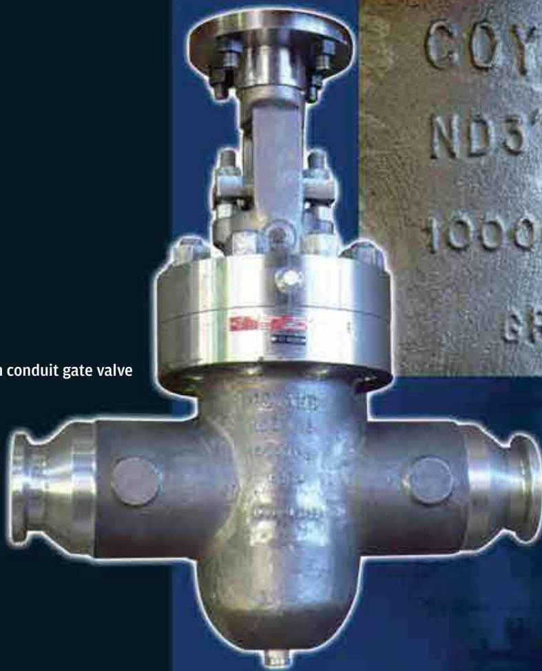
Through conduit gate valve