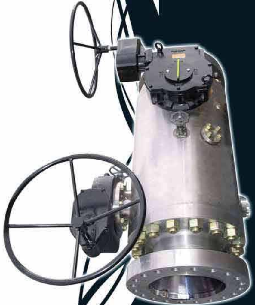
Double block and bleed ball valve