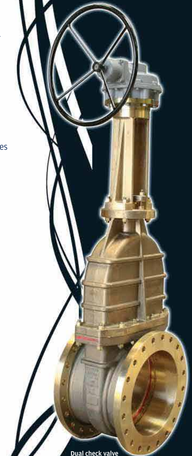
Dual check valve