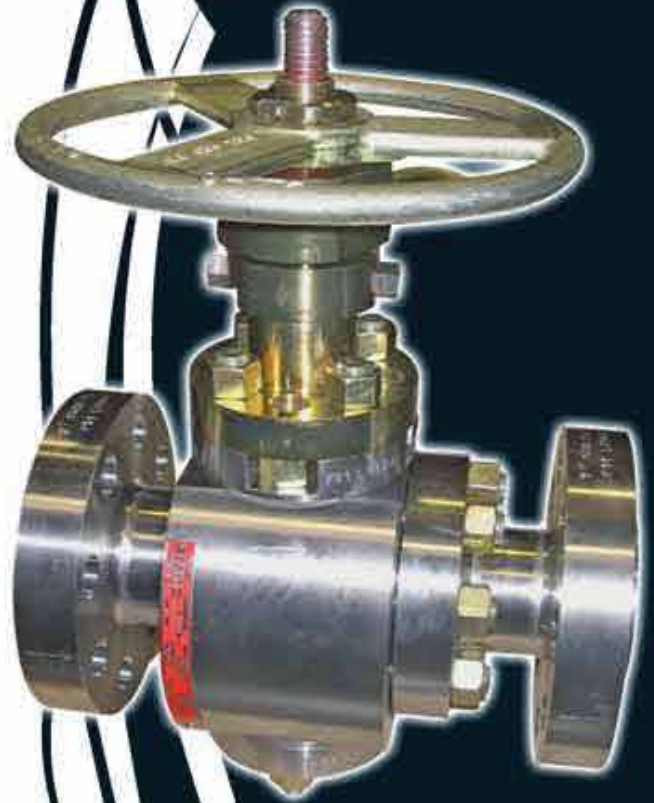
Rising stem ball valve

Our design office is able to meet any specific requests that you may have, or to incorporate the different features listed above in order to respond to your most exacting requirements.