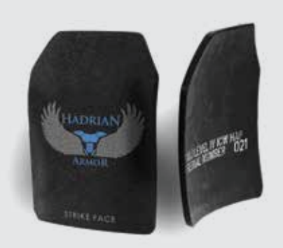
NIJ 0101.06 Certified

Optimal Armour is a specialised Composite solution designer and manufacturer, an ISO 9001:2008 company, and has, since 2006 designed, manufactured and delivered industry leading Anti-Ballistic products. Products include: